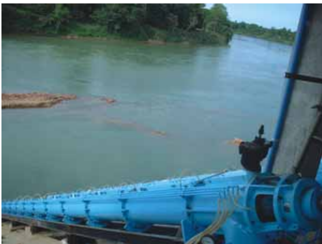
IRRIGATION & DRAINAGE